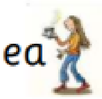
Cup of tea