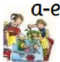
Make a cake