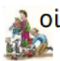
Spill the toy