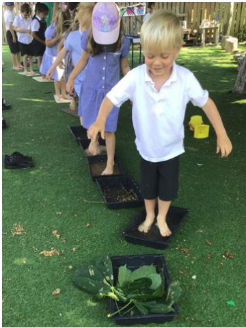
A Sensory Walk in the garden